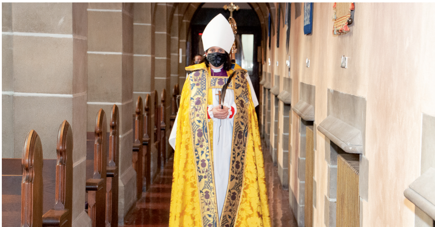
The new bishop proceeds down the cathedral aisle at the end of the ceremony.